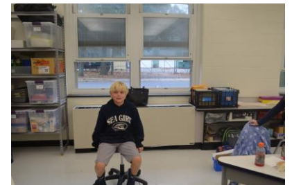
Quin- Scooby Doo 2