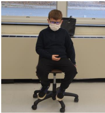
Jack-Jack O' Lantern